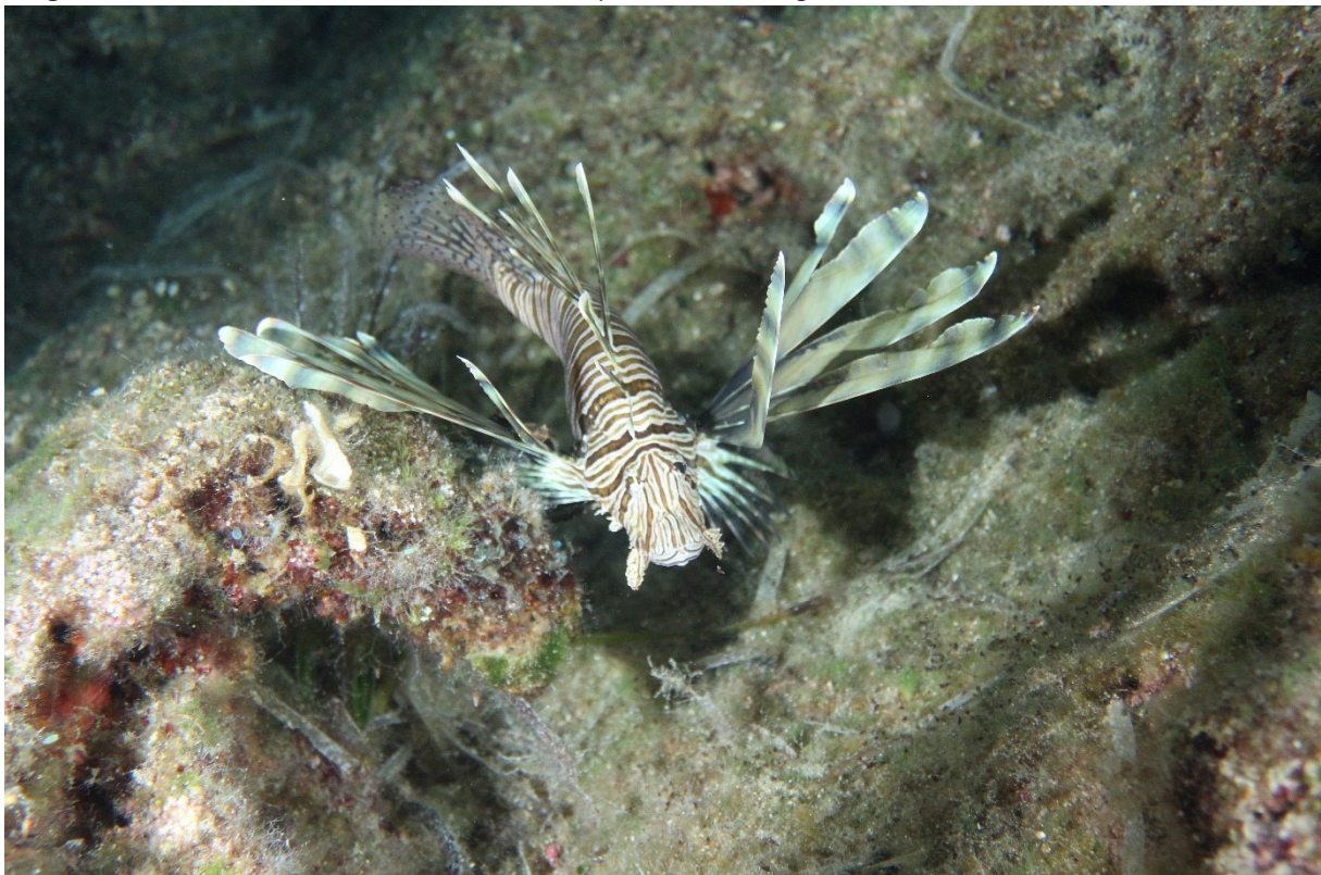
Figure 1. Underwater view of new recorded P. miles specimen in the Aegean Sea

Peer-viewed publications were priority sources, so a total of 26 reliable literatures were compared to obtain all available information on biogeographical (locality, coordinates) and historical traits (sampling date), and biological (sample size, catching/observation method) and ecological characteristics (habitat type, depth, temperature) of P. miles for the Mediterranean.