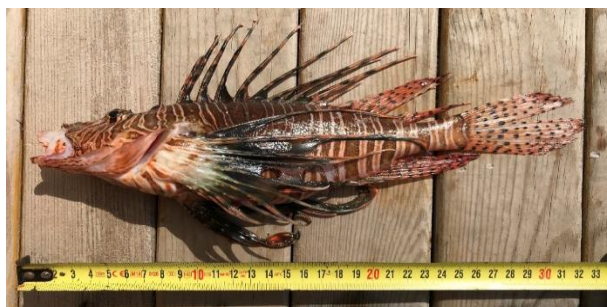
Figure 3. Adult specimen of P. miles from the İzmir Bay, Turkey

The specimen was 309 mm in total length (TL), 208 mm in standard length (SL) and 402 g in total weight. Morphometric measurements and meristic counts of the P. miles specimen were as follows: dorsal fin rays XIII+10; anal fin III+6; pectoral fin rays 14; pelvic fin rays I, 5; caudal fin rays 14, gill rakers 14. Body depth 36.9; head length 32.7 of % SL snout length 39.7; eye diameter 18.5 and interorbital width 20.1 % of head length (HL). Pelvic longest fin ray 38.2 and pectoral longest ray 63.4 % of SL (Figure 3).