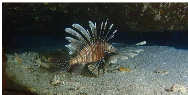
Figure 2. An underwater photograph of P. miles sampled in this study

The specimen was identified according to Golani and Sonin (1992) and Bariche et al. (2013). Morphometric measurements were taken using a digital caliper to the nearest 0.1 mm. Total length (TL, mm), standard length (SL, mm), and total weight (TW, g) were measured. The specimen was fixed in 4% formaldehyde solution and deposited in the fish collection of the Sea Museum of Izmir Kâtip Çelebi University, Turkey (IKC PIS 1262).