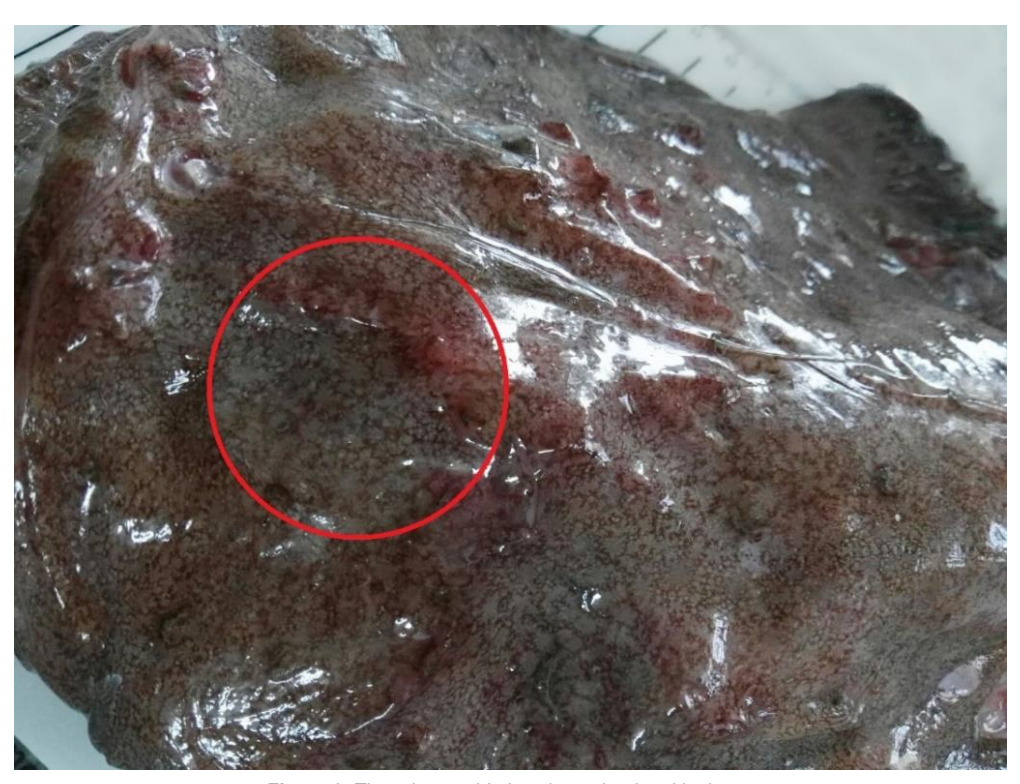
Figure 3. There is an orbital cavity under the skin tissue