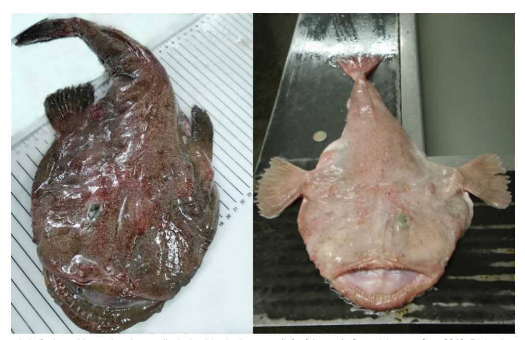
Figure 2. Left photo: Monocular abnormality in Lophius budegasssa (left of the eye), Central Aegean Sea, 2018. Right photo: Monocular leucism in Lophius budegassa (right of the eye), SE Irish Sea, January 2013.

This study supported by Ege University - Scientific Research Projects Coordination as 18-SUF-009 Scientific Research Project.