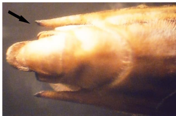
Figure 2. Ventral view of the apical abdominal segments of Limnopus rufoscutellatus (♂)