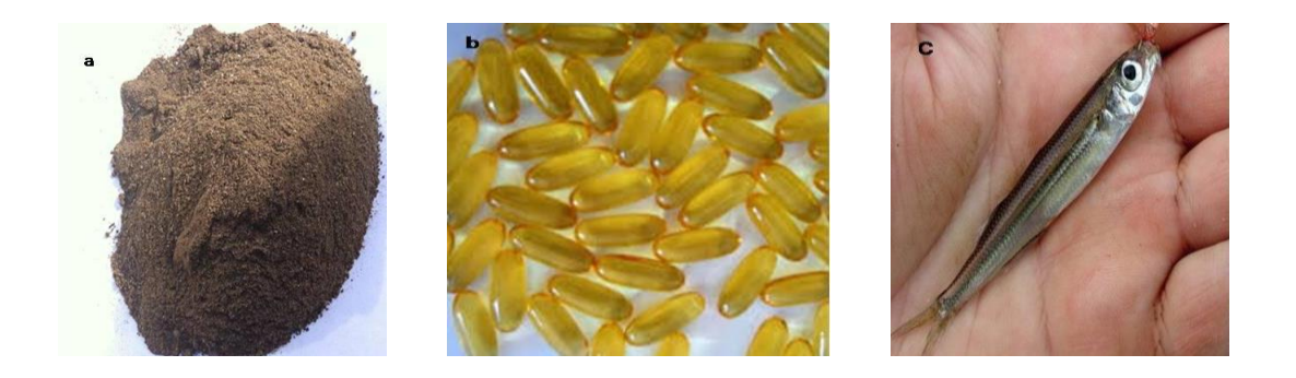
Figure 3. (a) Fish flour, (b) Fish oil, (c) Fish feed [11]

As the caught sand smelts are not commonly consumed by the public, they are utilized either as fish feed or as export products. Therefore, sand smelt has an important potential for the Turkish local fish production. In addition to the high nutritional value of sand smelt, its low price indicates that it is an important alternative raw material source for economical fish feed production [11-12].(Figure 3).