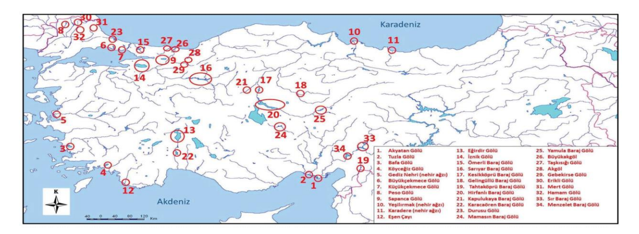
Sources: Altun (1991); Anonim (2005); Balik et al. (2005); Ozulug et al. (2005); Ekmekci et al. (2006); Kucuk et al. (2006); Ozulug (2008); Becer Ozvarol et al. (2009); Oguzkurt and Beklioglu Yerli (2009).

rapidly multiplying by showing high reproductive success, and as a result, they can become dominant species by invading empty pelagic niches. Depending on the life cycle characteristics such as short life span, early sexual maturity and long reproduction period, this species has a serious invasive species potential for Turkish freshwaters [1]. The predation pressure of sand smelt on zooplanktons, its competency with endemic species living in the environment and fish species with economic importance are the reasons for its adverse effects on biodiversity and ecosystem. The distribution area of sand smelt populations in Turkish freshwaters are rapidly increasing [2]. (Figure 2).