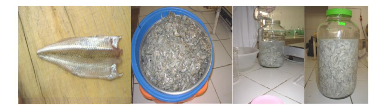
Figure 4. Marination process steps of sand smelt [16]

that sand smelt was suitable for marinade production (3% acetic acid and 10 % salt) technology (Figure 4). [17] have reported that, since the early 1980s, marinated marine products have been produced in Europe, especially in Italy, and these products were semi-conservated products, and sand smelts, sardines and anchovies have been used for this purpose.