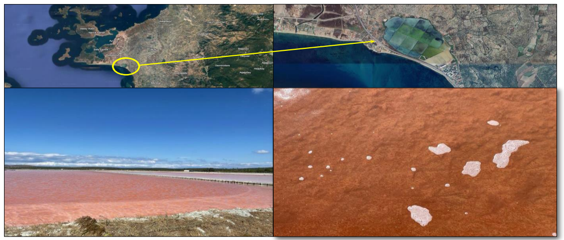
Figure 1. Sampling area (Ayvalık saltworks / Balıkesir / Türkiye).

The studied of Artemia population parthenogenetica were collected from Ayvalık saltworks through an annual survey and the parasitic infestation was detected for the first time from this location (Figure 1). The study area has Mediterranean climate and waterbird community dominated by flamingos (Phoenicopterus ruber). Artemia samples were collected with mesh plankton net (125 \mu m), were washed with sterile physiological saline water and directly fixed in 3% formalin and preserved in 70% ethanol. The samples were examined with light microscope (Olympus CX22RFS1) and parasite individuals were counted. Each individual was studied under a microscope for the presence of cestodes. The identification of parasites was performed according to Georgiev et al. (2005).