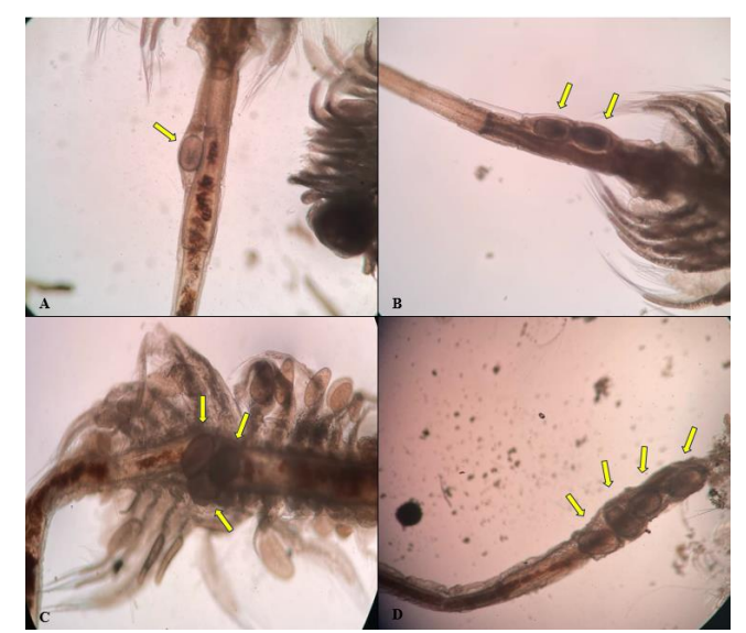
Figure 4. Multiple cestode presence in A. partenogenetica.

The intensity of the parasitism was varied between one to four per individual. The maximum number of cysticercoids were detected as four for one individual (Figure 4).