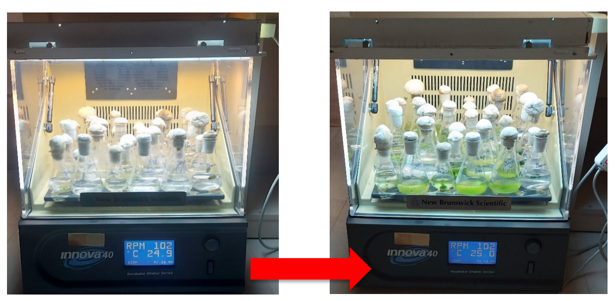
Figure 2. Cultivation of isolates

The isolates were inoculated into horizontal agar tubes containing agar-BG 11 and incubated at 25 \pm 2 °C under 48 \mu mol/m<sup>2</sup>s (2400 lx) light and stock cultures were obtained.