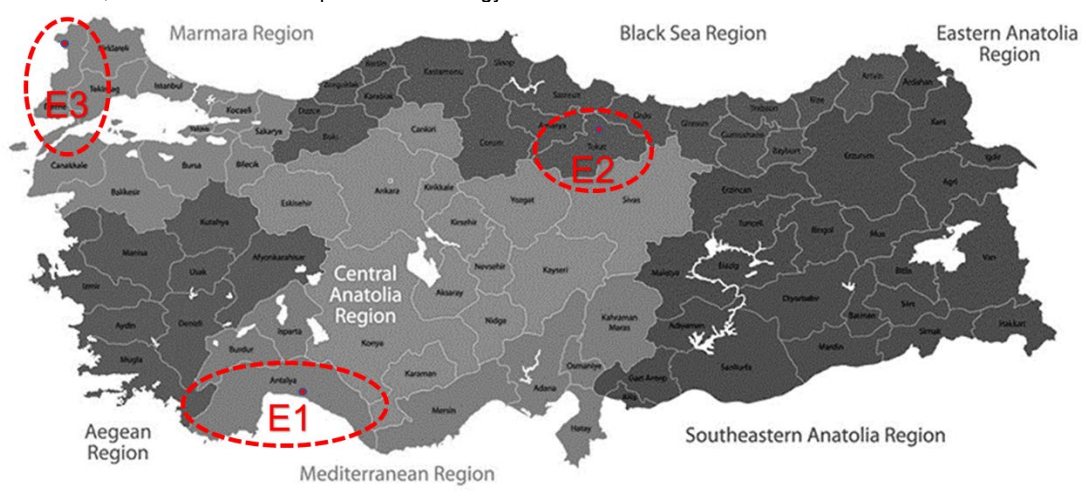
Figure 1. Representation of the regions where water samples were taken on the map of Türkiye

Freshwater samples were taken from 3 different regions of Türkiye (Figure 1), whose coordinates are given in Table 1, during the summer season. Freshwater samples were collected into 50 mL falcon tubes and immediately transferred to the laboratory environment.