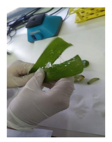
Figure 1. A. vera latex and gel parts

epidermis was carefully separated from the parenchyma (Fig 1). The resulting latex and gel parts were homogenized and freeze-dried.