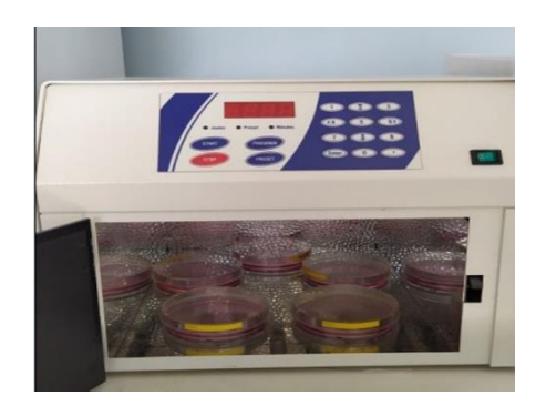
Figure 4. UV-C application to A. vera coated cell plates

5. Gel Double Side: 500,000 cells in the medium + the inner and outer surfaces of the petri dish are coated with gel