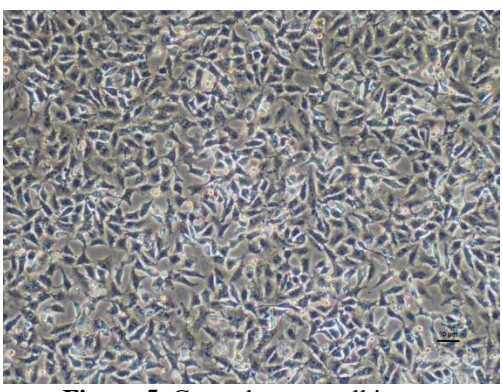
Figure 5. Control group cell image

The morphological structure of the cells that covered the surface of the flask and did not have any UV-C exposure is shown in Figure 5. Here the cells are spread out and appear to be together. After 1 hour of UV-C application, it is seen that the cells start to die and separate from each other as in Figure 6. After the 2nd hour UV-C exposure, the cells were seen to die completely (Fig 7), while at the 3rd hour, it was observed that the cell nuclei were fragmented (Fig 8).