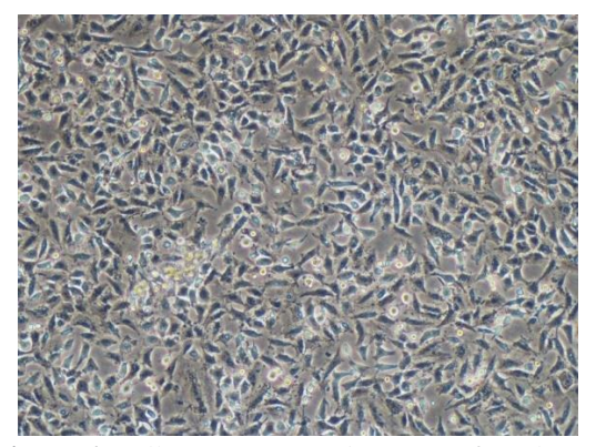
Figure 6. Cell Image Exposed to UV-C for 1 hour