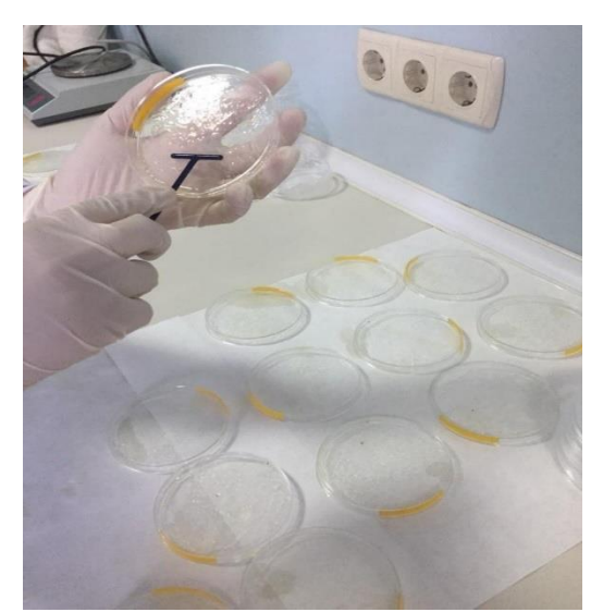
Figure 2. Spread of A. vera parts on the petri dish

A. vera latex and gel parts were spread as a thin layer on the top cover of the petri dishes, both on one and both sides (Fig 2). Petri dishes, which were left to dry at room temperature without sunlight, were then stored at room temperature.