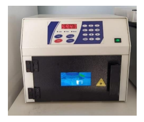
Figure 3. UV-C application to cells

The cells produced and covering the flask base were treated with UV-C for 1, 2 and 3 hours. A UV transluminator (DNR-IS) device, which produces light with a wavelength of 254 nm and an intensity of 8000 \mu W/cm at room temperature, was used as a UV-C light source (Fig 3). At the end of each hour, cells were observed morphologically under an invert microscope.