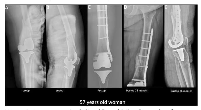
Figure 3. Anteroposterior (A) and lateral (B) radiographs of a 57-year-old female patient with a periprosthetic distal femur fracture treated with less invasive stabilization system plate (C). Anteroposterior (D) and lateral (E) radiographs demonstrating fracture healing.

Descriptive statistics were expressed as mean±standard deviation for continuous numerical variables, categorical variables were expressed as the number of patients and percentage. Distribution of variables was measured with the Kolmogorov-Smirnov test. Statistical analysis was performed for continuous variables with student t-test and Mann Whitney-U test when appropriate. Categorical variables were compared with Pearson Chi-square test. Analyses of the data were performed using the IBM SPSS Statistics 23.0 (IBM Corporation, Armonk, NY, USA) program. The results were considered statistically significant when the p-value was <0.05.