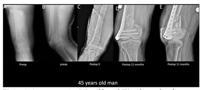
Figure 2. Anteroposterior (A) and lateral (B) radiographs of a 45-year-old male patient with a distal femur fracture treated with less invasive stabilization system plate (C). Anteroposterior (D) and lateral (E) radiographs demonstrating fracture healing.

periprosthetic group ( Figure 2 ) and the periprosthetic group ( Figure 3 ). Groups were compared based on demographics, functional outcomes, quality of life parameters, and complication rates.