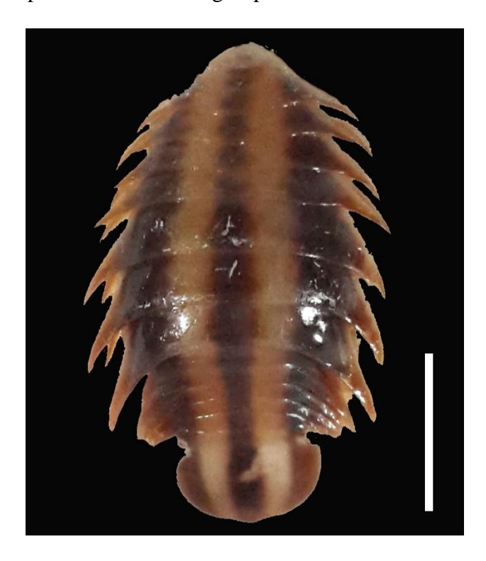
Figure 2. Dorsal view of Nerocila bivittata (scale bar: 5 mm)

in width. Pointed lateral margins of pereonites extended to posterior. Along the longitudinal axis, width of pereonites (from 1 to 5) increased gradually and slightly. Cephalon, extending onto first pereonite, has slightly rounded posterior margin. Pereonite 1 is the narrowest part of the pereon, while pereonite 5 is the widest. Posterior margins of pereonite 5 to pleon 5 has bow like concave shape and lateral margins of pereonite 7 extending to pleon 5.