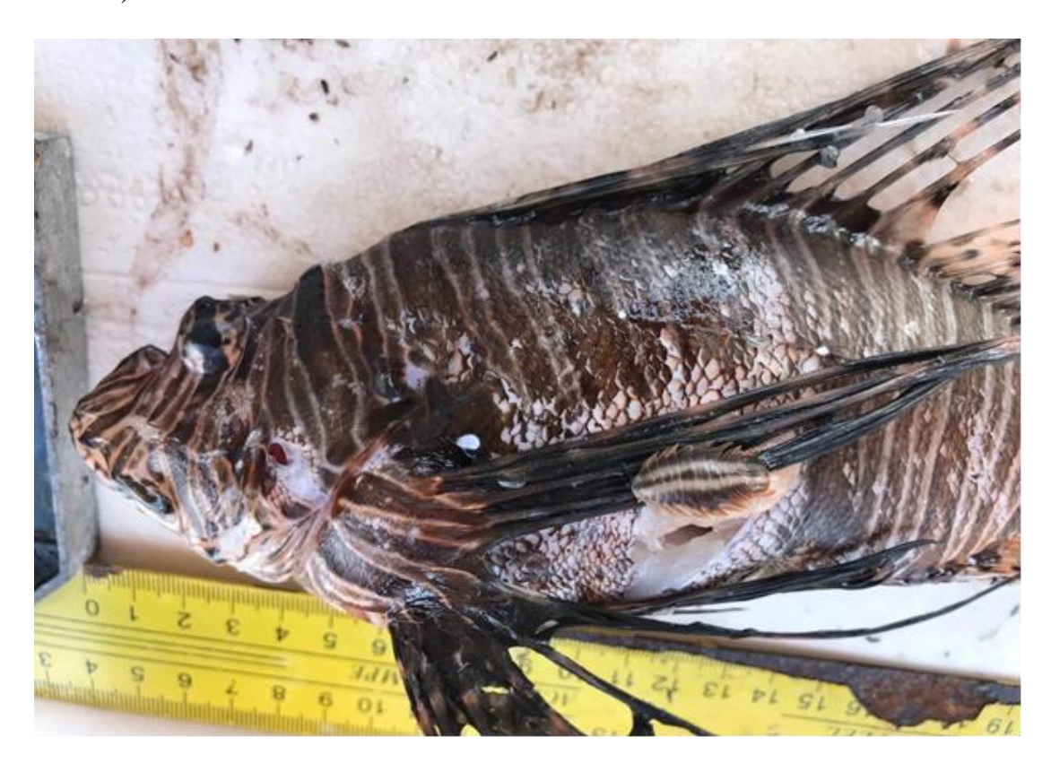
Figure 1. Nerocila bivittata attached to the pectoral fin of Pterois miles

Two non-ovigerous females; collected from the pectoral fin of lionfish, Pterois miles (Bennett, 1828) caught from eastern Mediterranean waters of the Gulf of Iskenderun and the Aegean Sea waters, off Bodrum province (Figure 1). Specimens were deposited in the collections of the Department of Marine Sciences in Iskenderun Technical University (Registration Number: 2021-PC-008).