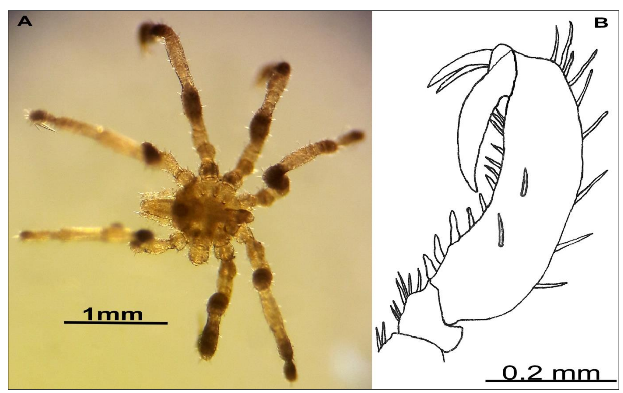
Figure 4. Tanystylum conirostre (Dohrn, 1881), ♂, from Antalya Bay. A-Dorsal view; B-Tarsus and propodus of left leg 4.