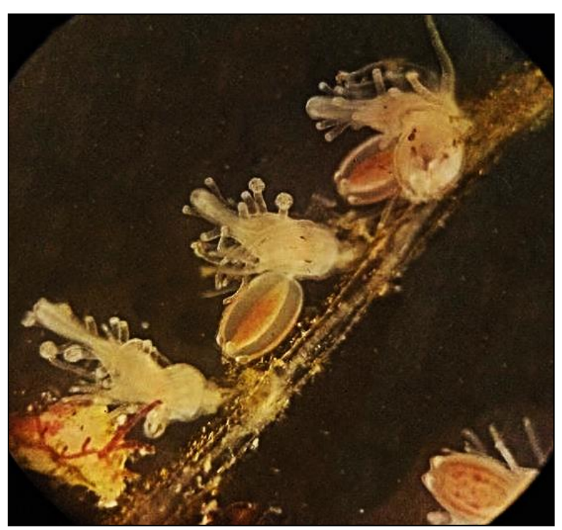
Figure 1. Pennaria disticha Goldfuss, 1820, where the pycnogonid specimens are collected.