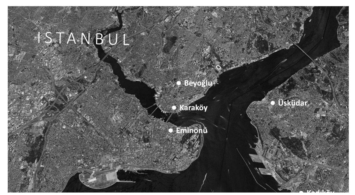
Figure 1. The locations of sampled local fish markets.

Atlantic mackerel samples were obtained from local fish markets located in five main regions (Region I= Eminonu, Region II=Uskudar, Region III= Kadıkoy, Region IV= Karakoy and Region V=Beyoglu) of Istanbul (Fig 1). Sampling (n=15) was carried out in these markets during spring season, 2018. According to the label information of the batches, Atlantic mackerels were caught from the Atlantic, Northeast (FAO 27). These samples were produced in Norway and the production time of them varied between 20.10.2018-05.09.2018.