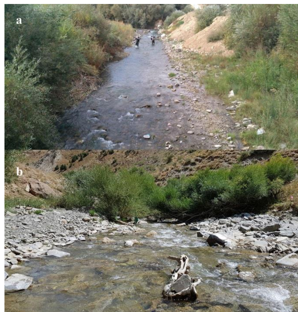
Figure 5. View of sampling sites; a, Esendere Stream; b, Onbaşilar Stream

Distribution. Oxynoemacheilus elsae described from Zarineh-Simineh, Sofi and Mahabad rivers drainages, Lake Urmia basin, Iran. Here, the species was found in Kesran Stream where is the draining to Esendere Stream (Figures 1 and 5).