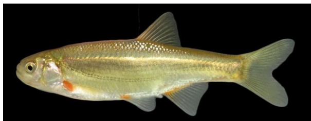
Figure 2. Alburnoides petrubanarescui , FFR 7016, 73 mm SL, Esendere Stream

Alburnoides petrubanarescui Bogutskaya & Coad, 2009 (Figure 2)