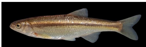
Figure 3. Alburnus atropatena , FFR 8814, 125 mm SL, Onbaşilar Stream

Alburnus atropatena Berg, 1925 (Figure 3)