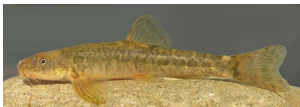
Figure 4. Oxynoemacheilus elsae , FFR 15536, 53 mm SL, Kesran Stream

Oxynoemacheilus elsae Eagderi, Jalili & Çiçek, 2018 (Figure 4)