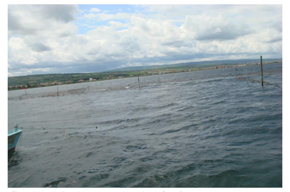
Figure 2. A typically stationary uncovered pound net in Saros Bay