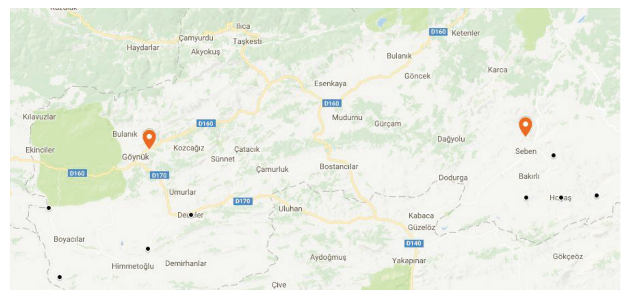
Figure 1. Map showing the survey areas of Göynük and Seben districts in Bolu province between 2016 and 2019 depicted in red, within the study region

Central Research Institue, Ankara. During 4 years, a total of 306 samples including 75 cherries and 166 peaches from Seben, and 29 cherries and 36 sour cherries from Göynük were analysed for the presence of PPV.