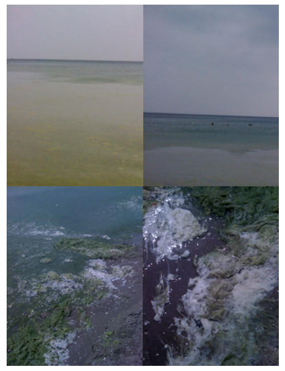
Figure 3. Masses of Cladophora laetevirens in the study area