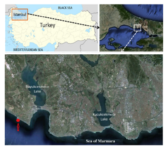
Figure 1. Satellite location of sampling site, Kumburgaz Istanbul.

and "Olympus CK2" inverted phase contrast microscope equipped with a microphotosystem. C. laetevirens was identified according to Söderström (1963).