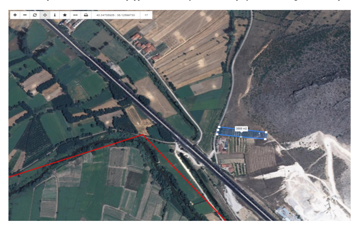
Figure 1. Aerial view of the land

The study was conducted on an agricultural land located 35 km away on the Tokat-Turhal highway. This plot spans an area of 3,688 square meters and exhibits hillside characteristics with a 25% slope. An aerial view of the land can be accessed in Figure 1. The land encompasses 22 distinct sections. These sections cultivate a variety of agricultural produce including apple and peach trees, grapevines, and crops such as tomatoes and peppers. Historically, this area employed a flood irrigation technique.