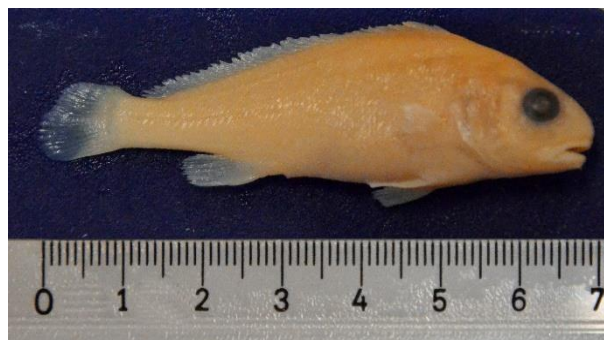
Figure 1. Sample of hybrid fish

(To and Ci, 2015). In this study, potential effects of 70% alcohol preservation to 39 juvenile individuals were ignored.