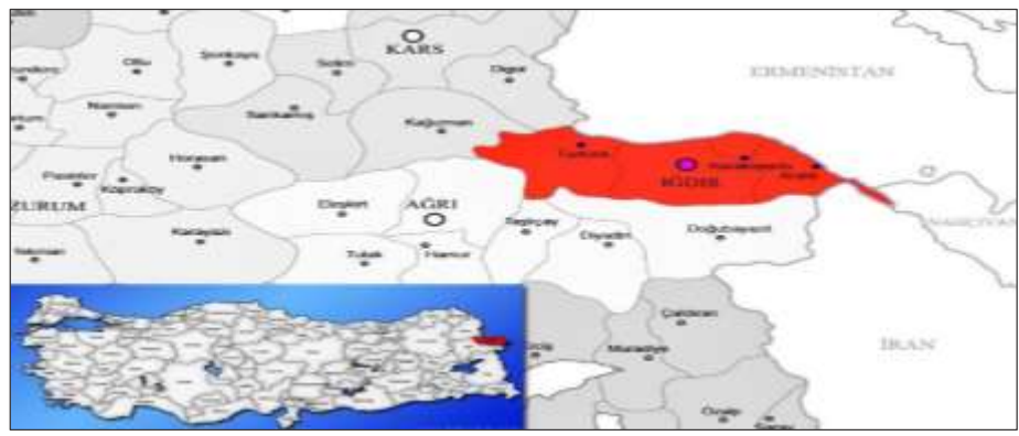
Figure 1. The location of Igdir province in Turkey Şekil 1. Iğdır ilinin Türkiye'deki konumu

studies, reports and statistical data of various organizations on the subject were also utilized to support and validate the outcome of this work.