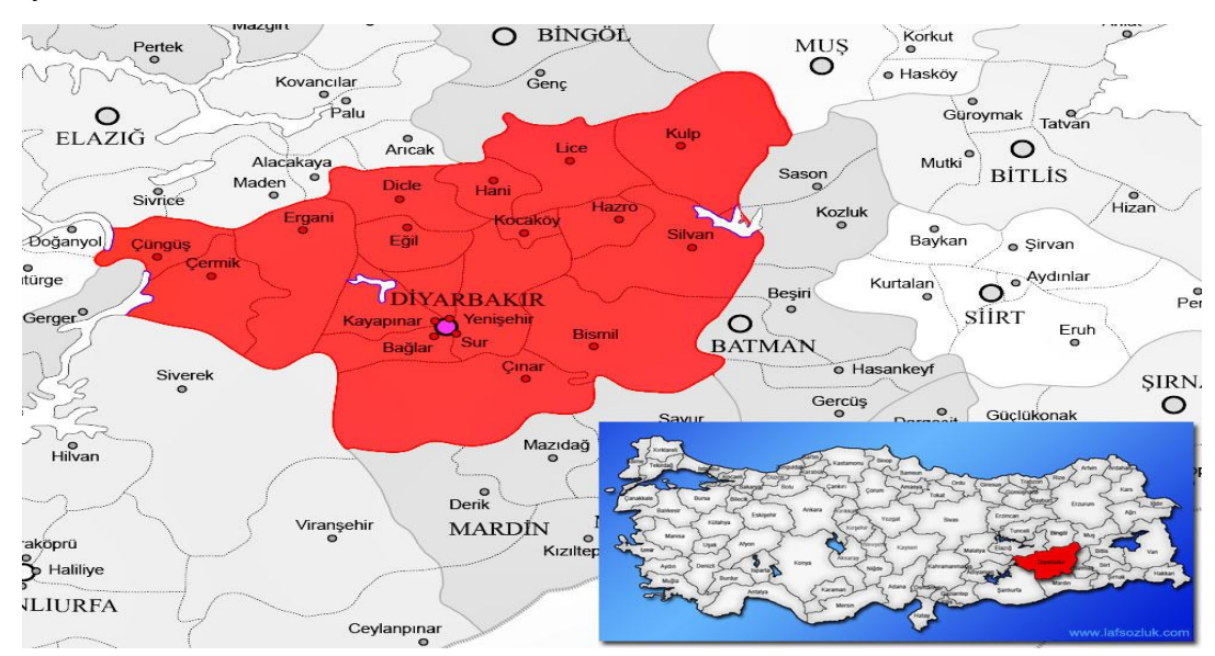
Figure 1. Location of study area

Diyarbakir province, which ranks 7th in Turkey's watermelon production (TUİK, 2021), have been selected as the study area. (Fig.1). Diyarbakır province is in located the central part of Southeastern Anatolia Region of Turkey, lies between 37° 56' latitude and 40° 13' longitude and the altitude is average 650 m (Anonymous, 2019a)