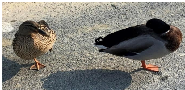
Figure 1. A hen (left) and a drake (right) mallard duck ( A. platyrhynchos from Şirince, Selçuk/Izmir in 2019.

Cleland, 2001; Strayer, 2010). Freshwater habitats are in danger because of biological invasions (Ruiz et al., 1999; Green et al., 2008). The biological invasions' negative results, prompted study in terms of management and impacts of invasion (Reynolds et al., 2015). It is known that new management strategies are needed for all invasive species. In order to create the new management strategy for them, both the predators and the vectors of the invasive species should be determined in detail.