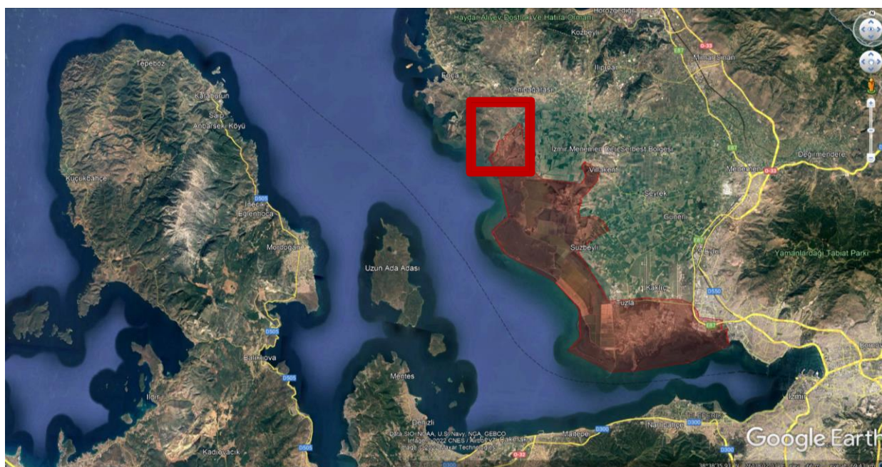
Figure 2. The map of the dead mallard duck was found ( www.earth.google.com )