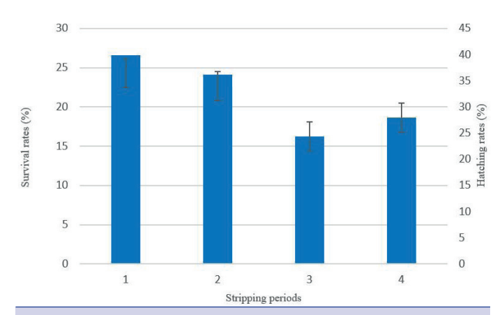
Figure 2 . Comparison of hatching rate (%) and larval survival rate (%).

broodstocks throughout the experiment, unfertilized eggs, losses in incubators during the larval period were also calculated and noted (Table 3).