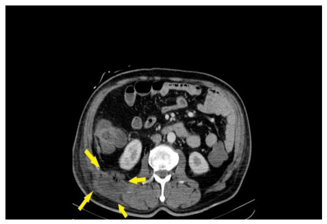
Figure 5. CT scan shows a right flank abscess of 70 * 50 mm in size.