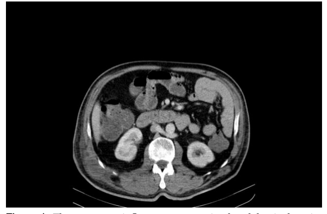
Figure 4. There was no inflammatory area in the abdominal cavity postoperatively.

still high, but there was no fluid coming from the drains. Therefore, abdominal USG was performed on the patient and no pathology (abscess or fluid collection) was observed. All drains were removed on the sixth postoperative day. CRP level (27.2 mg/L) and leukocyte count (18x10<sup>3</sup>/mm<sup>3</sup>) were still high on the seventh postoperative day. Therefore, contrast-enhanced abdominal CT was planned for the patient. CT scan revealed a 70*50 mm abscess on the right flank without intra-abdominal abscess (Figure 4 and 5). The flank abscess drainage was performed under sedation. Abscess material was studied for culture and antibiogram. Since Enterococcus faecalis grew in the antibiogram and was sensitive to ertapenem, the current antibiotherapy was continued. Daily wound cleaning was performed with rifamycin 125 milligram/1.5 millimeter vial (every 12 hours) and 3% hydrogen peroxide. Intravenous ertapenem treatment was completed to 14 days. The patient was discharged when all laboratory parameters were normal [CRP level (1.2 mg/L) and leukocyte count (7.6x10<sup>3</sup> / mm<sup>3</sup>)] on the postoperative day 14. The flank incision left to secondary healing. The wound was closed on the 15thday after discharge. No pathology was detected in the control of the patient in the first month after discharge. Written informed consent was obtained from the patient for publication of this case.