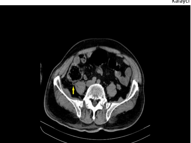
Figure 1: CT scan showed enlarged 12mm diameter appendix tissue with an intact radix.

There was no laboratory pathology except for C-reactive protein (CRP) elevation (31 mg/L) and leukocyte count elevation (25.1x10<sup>3</sup>/mm<sup>3</sup>). Computed tomography showed an appendix with a diameter of 12 mm (Figure 1) and paracolic inflammation with suspicious abscess (Figure 2 and 3). Laparoscopic surgery was planned for the patient. Purulent fluid was present in both the Douglas's pouch and