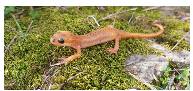
Figure 3. A general view of a female individual of Lyciasalamandra billae from Sarısu population.

mm in the male. Head width was 11.97 mm in the female and 11.83 mm in the male. All morphometric measurements of the individuals collected from the population are given in Table 1.