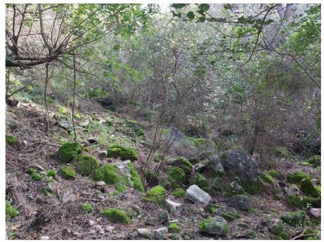
Figure 2. The habitat of Lyciasalamandra billae in Sarısu.

mm in the male. Head width was 11.97 mm in the female and 11.83 mm in the male. All morphometric measurements of the individuals collected from the population are given in Table 1.