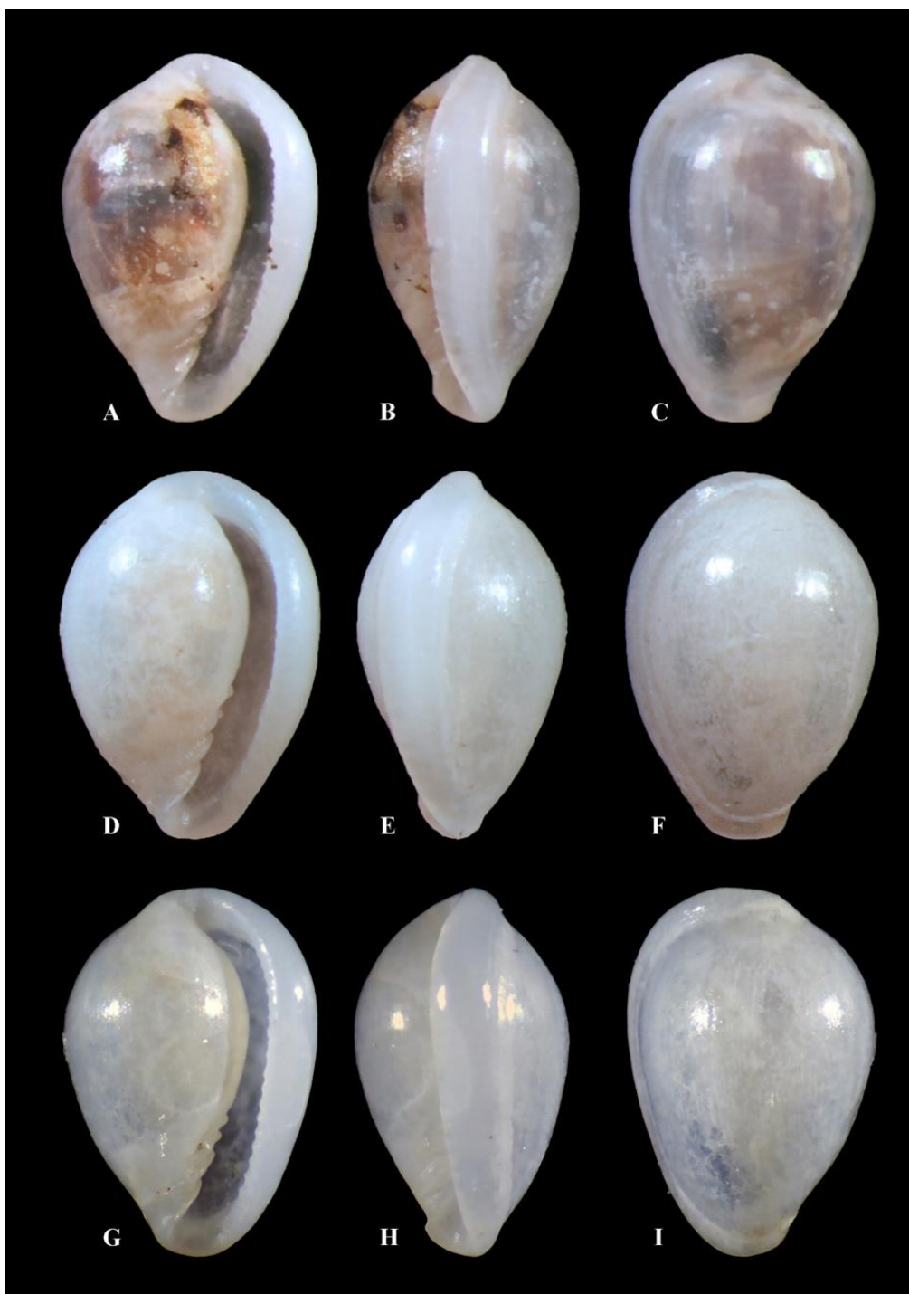
Figure 1. A-I. A-C. Granulina melitensis , holotype MZB, Malta, 100-120m, L = 2.2 mm.

And last, we must notice that the holotype of G. pusaterii (Figure 1, D-F) as well as its topotypes (Figure 1, G-I) are all showing their apical labrum bending backwards, what was considered by the describers themselves as a specific feature characterizing G. melitensis , when they described this species (see above).