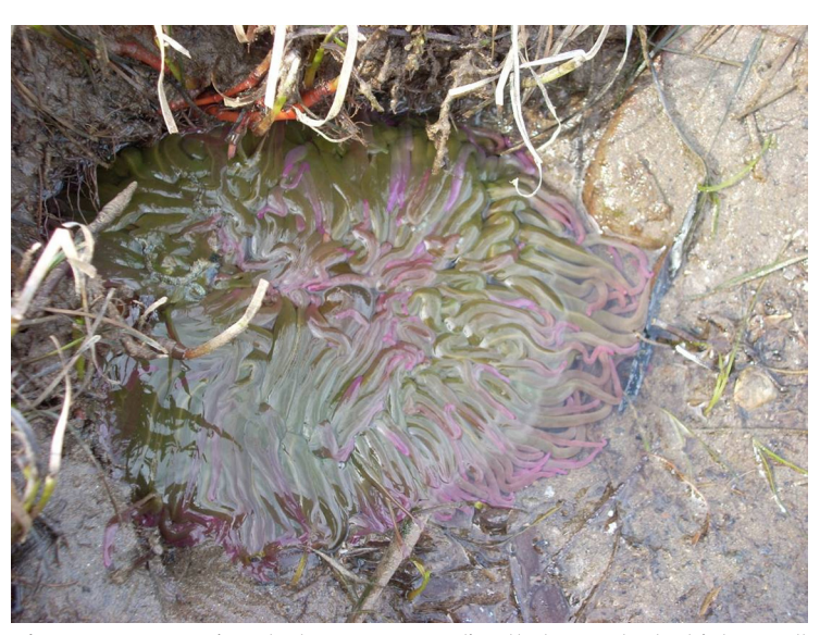
Figure 4. Anemonia sulcata var. smaragdina that was stucked into small area.