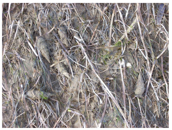
Figure 7. C. vulgatum.