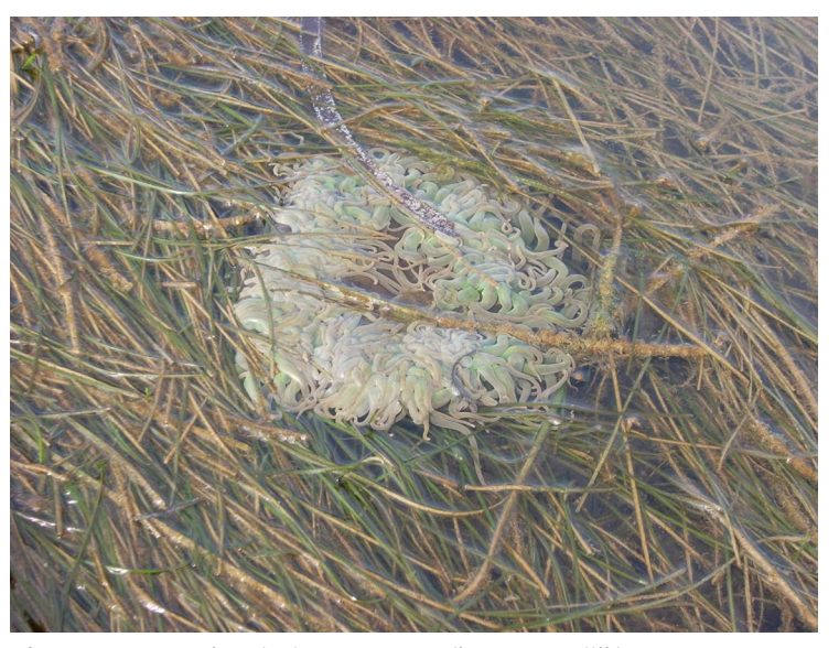
Figure 5. Anemonia sulcata var. smaragdina on Z. noltii leaves.