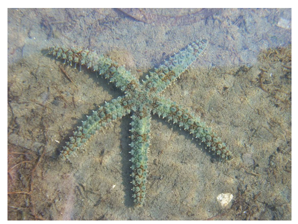
Figure 9. M. glacialis sample which was under sea tide threat.