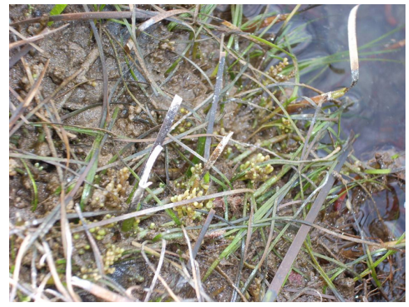
Figure 3. Invasive C. racemosa var. cylindracea within Z. noltii and C. nodosa leaves.