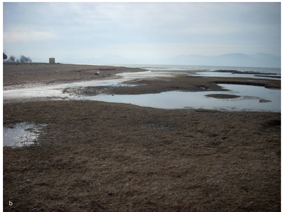
Figure 2. Low tide area with a distance of about 75 m from the coast. a) A view of tide area from the coast. b) A view of tide area from the sea. In both Figures, decomposing Z . noltii beds can be seen clearly.