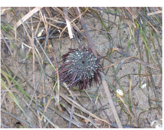
Figure 8. A decomposed sample of P. lividus .