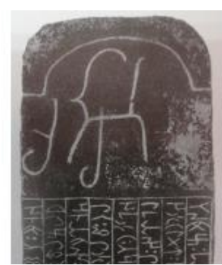
Mountain goat figure in Ongin inscription (Radlov 1892: 63)

In 1889, the famous researcher N. M. Yadrintsev discovered Old Turkic and Chinese engraved inscriptions on the Koço Saydam region of Mongolia and this discovery had aroused great excitement in the science circles. It was soon determined that the inscriptions deciphered by V. Thomsen belong to II. Turk Khaganate and were written in the first half of the eighth century. Along with the inscriptions made in honor of the rulers of the state, petroglyphs with mountain goat figures were also found at the top of the inscriptions. V.Radlov, accepted as the founder of Turcology, asserted that the mountain goat petroglyphs engraved with the inscriptions of Ongin (dating back to 720), Ashete (724), Kultegin (732), Bilge Kagan (735) and engraved at the top of the inscription on many tombstones are "xanskaya tamga" ('khan tamga') and it is the symbol of dynasty of Turk Khaganate state (Radlov 1892: 16-17).