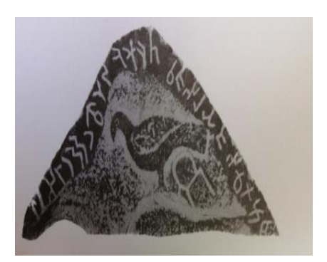
Mountain goat figure (under the bird figure) in Ashete inscription (Radlov 1892: 64)