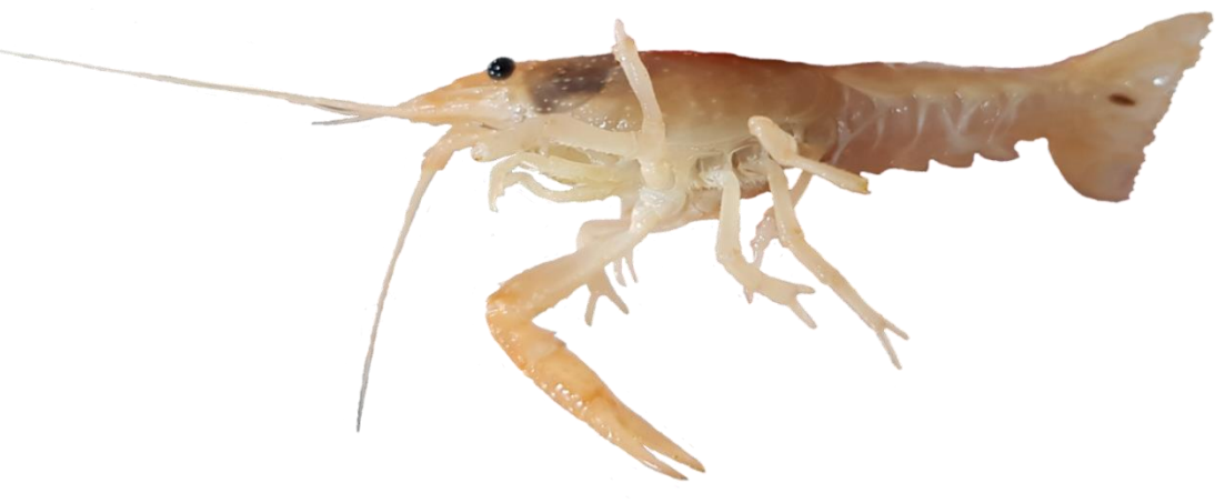
Figure 1. General view of the female red swamp crayfish (Procambarus clarkii) specimen

Details and measurements of abnormal appendage were shown in Figure 2. It has been observed that the base of the appendage (0.65 cm) emerged from the root of left cheliped and it branched elongated. The appendage has two branches: a taller in the right (1.27 cm) and a shorter-spiny in the left (1.06 cm). Taller branch has a one joint and two parts (0.70 and 0.57 cm). Shorter branch has a spine at its end (0.19 cm).