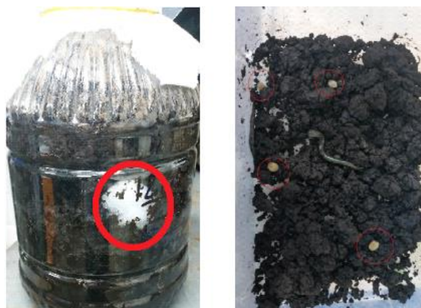
Figure 2. Moist peat environment. The bold circle is showing a new deposited cocoon with white foam. The other circles are showing the cocoons in the peat

In experiment with moist peat, peat was poured out from jars to find cocoons inside once a week. A total of 47 cocoons with the average per leech 3.13 \pm 0.74 were taken from the moist peat environment (Figure 2).