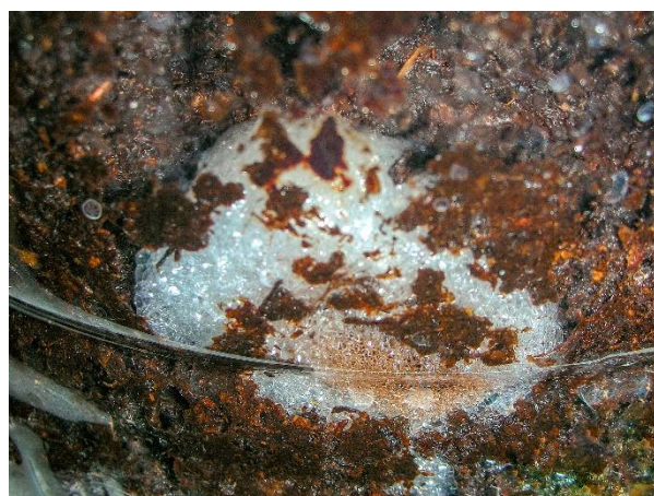
Figure 4. Recently deposited cocoon in peat material. Leech must have made a gap before depositing cocoon. The gap could be seen around the white foam

As an advantage, peat has the highest numbers of cocoons and offspring for leech reproduction even though the difference was not statistically significant ( P > 0.05 ). Natural behaviour of medicinal leeches to deposit their cocoons dark, damp places into moist soil on terrestrial habitat ( Kutschera and Roth, 2006 ; Kutschera and Shain, 2019 ). Cocoons initially surrounded by a foamy substance then take the final solid form ( Saidel et al., 2018 ) like an egg covered by thin sponge. Saidel et al. (2018) thought this three-dimensional structure of cocoon protects itself from desiccation and displacement. Also leeches may have an instinct to protect their cocoons by depositing them into moist soil. Leeches must find or make a gap for placing cocoon ( Figure 4 ).