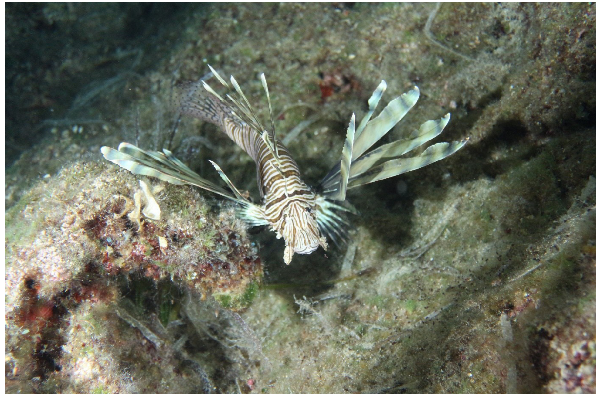
Figure 1. Underwater view of new recorded P. miles specimen in the Aegean Sea

On 05 April 2017, one specimen of P. miles (Figure 1) was observed and photographed by a SCUBA diver from off Didim coast (37°20'N, 27°14'E) on a rocky bottom at depths of 18 m. The water temperature was 14.3 °C. The specimen was identified based on the description provided by Golani et al. (2006) using high quality photos.