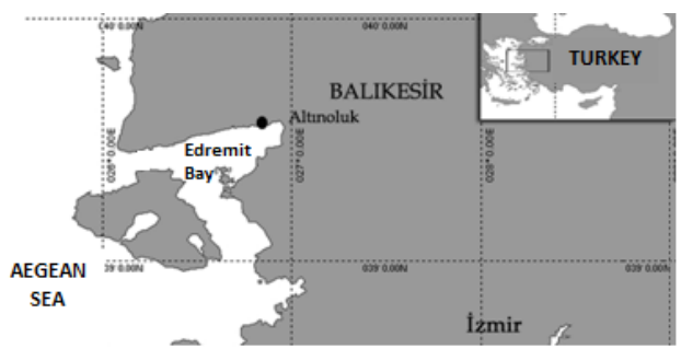
Figure 1. Map of Turkish Aegean Sea coasts with the study area: Altınoluk

The research was carried out in Altınoluk which is fishing and tourism district with the 13,800 population located innorthern Aegean coast of Turkey (Figure 1). Altinoluk County was found eligible for thepilot project of Turkish National AR Master Plan. Small-scale fishery dominates fishing activity in Altınoluk. 95% (55 commercial fishermen) of fishermen are organized under the Altınoluk Fishery Cooperative in the region. Altınoluk Fishery Cooperative was established in 2006 with the support and leadership of an extraordinary and innovator local fisher. The cooperative keeps seven employees permanently during the whole year and twenty employees temporarily during the summer time due to it also runs cafe, restaurant and aquarium (Unal et al., 2009). In this region, recreational fishing is another demanding activity on shore and/or by boat, and nearly 400 recreational fishermen attending this activity. Additionally, there is one diving charter in Altınoluk which only activates in the summer season.